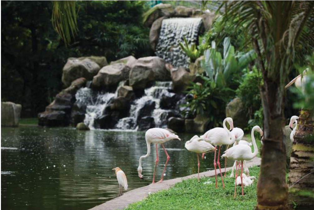
Fig. 2.1 for Question 2